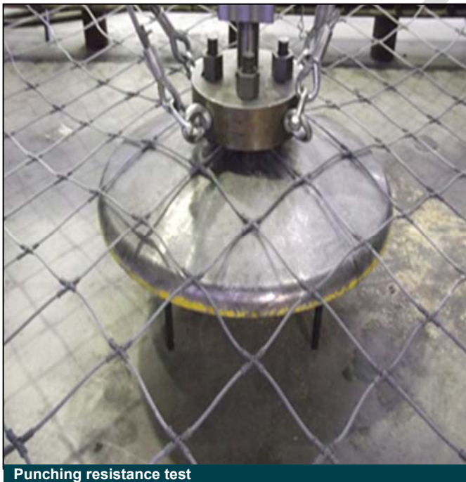
Punching resistance test

It is possible to request HEA panels made of Stainless Steel ropes, to withstand very aggressive environmental conditions. The resistance parameters will vary accordingly.