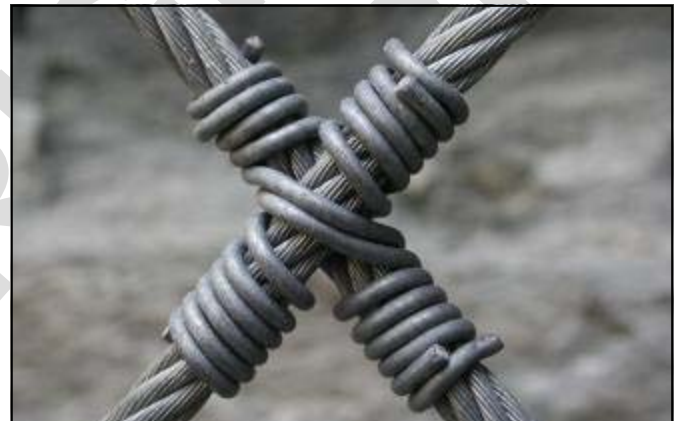
Lacing knot detail