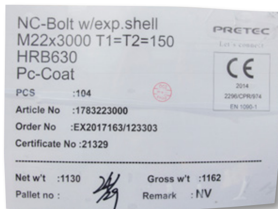
Standard label marked with certificate number

Certificates in compliance with EN 10204 3.1 are available for inspection. Approvals for bolts from the Norwegian Public Road Administration and Bane NOR (Norwegian Railway Authority) for use in Norwegian infrastructure tunnels are available on request.