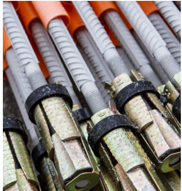
Nc-bolts with mounted expansion shells