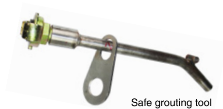
Safe grouting tool