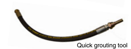
Quick grouting tool