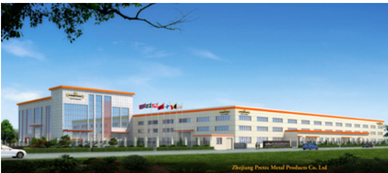
Factory in Haining, Zhejiang, China. Total area: 22000 m2. Content: mechanical production, hot dip galvanizing and powder coating.

Product data sheets and brochures for both bolt types can be downloaded from www.pretec.no