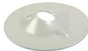
Spherical bearing plate