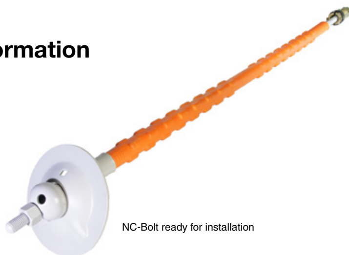
NC-Bolt ready for installation