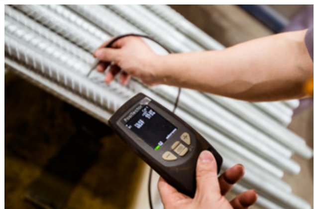
Control of coating thickness