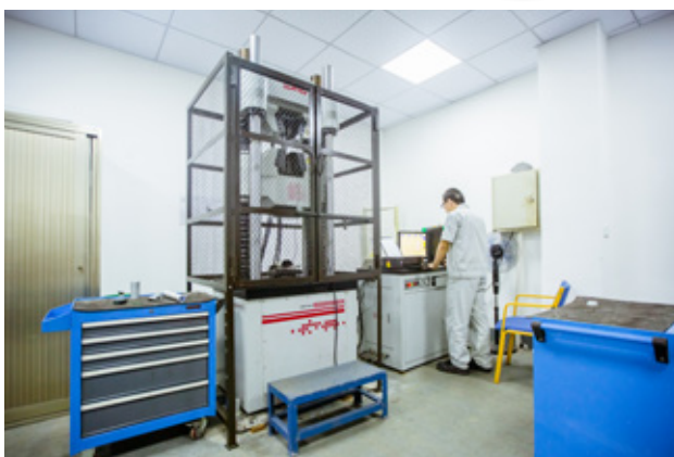
Pretec China laboratory