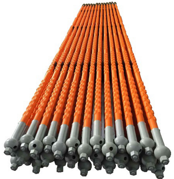
NC-Bolts packed on pallet.